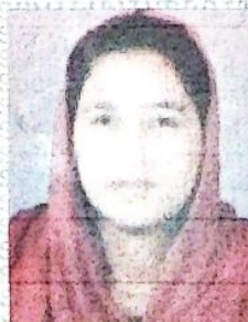
Photograph of the Candidate